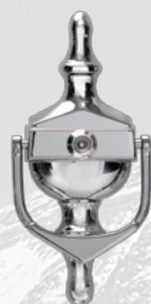
Urn with Spyhole